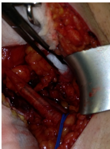
Fig. 2 – Previous reconstruction with a Dacron bifurcated prosthesis.