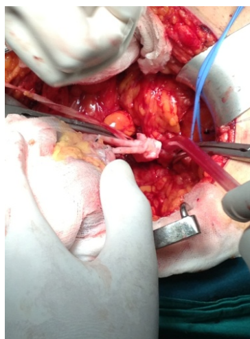
Fig. 3 – Renal artery anastomosed with the right branch of bifurcated graft in the "end-to-side" fashion with continuous 6/0 polypropilene.