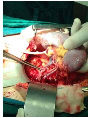
Fig. 5 – Final picture – spiral sewing and lumen reduction.

sis. On the second postoperative day diuresis was 11 L per 24 h and creatinine level decreased to 350 mmol/L. Abdominal ultrasonography excluded hydronephrosis, perirenal or retroperitoneal collections. Anti-thymocyte globulin (ATG), methylprednisolone, mycophenolat mofetil and tacrolimus were used as immunosuppressive therapy. The patient was discharged on the 18th postoperative day after the uneventful postoperative period. On the discharge day 5 L of diuresis and creatinine 95 mmol/L were recorded. One year after the transplantation, kidney function was satisfied, with diuresis of 3 L per 24 h, creatinin level of 99 mmol/L and good perfusion of kidney and flow through anastomoses verified by color Doppler exam.